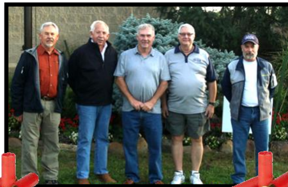
2018 1st Place Team - UBS

Why Scouting is important. Scouting provides youth with opportunities to reinforce ethics, service to the community, try new activities, and build self confidence.